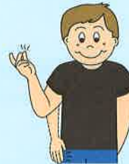
dog Snap fingers twice using thumb and middle finger, or pat right thigh twice.