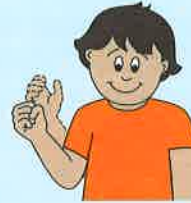
milk Right hand squeezes as if milking a cow.