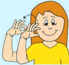
cat Pinch together index finger and thumb near cheek as if pulling whiskers.