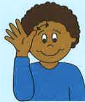
daddy With open hand, tap forehead twice.