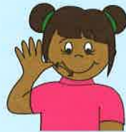
mommy With open hand, tap chin twice.